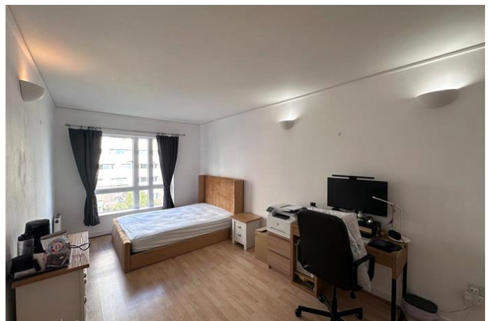
FLAT , MAURER COURT, JOHN HARRISON WAY, LONDON £2,300 PCM