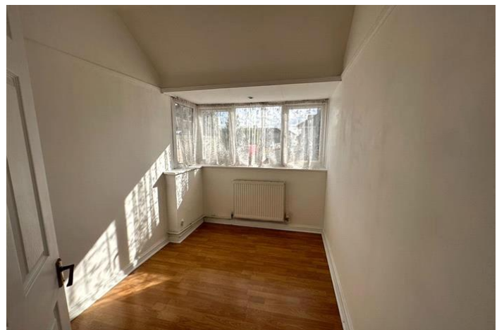
OVAL ROAD NORTH, DAGENHAM £2,000 PCM