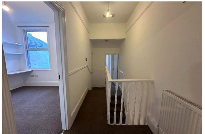
MALVERN ROAD, LONDON £2,700 PCM