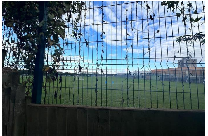
TEMPLE AVENUE, DAGENHAM OIRO £435,000 Freehold