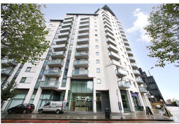
FLAT , LIMEHARBOUR, LONDON £340,000 Leasehold