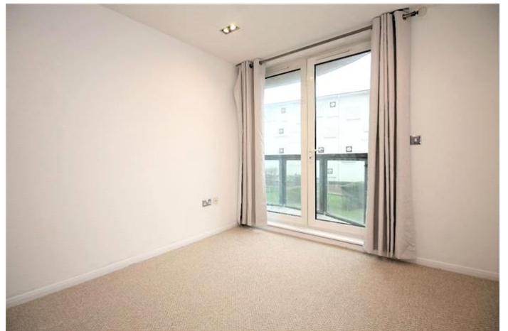
FLAT , LIMEHARBOUR, LONDON £553,000 Leasehold