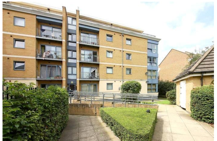
FLAT , SHERWOOD GARDENS, LONDON £320,000 Leasehold