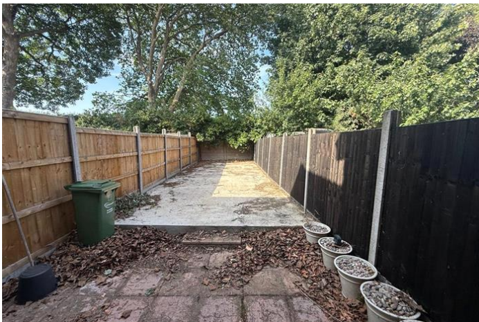
HOLDEN CLOSE, DAGENHAM £1,850 PCM