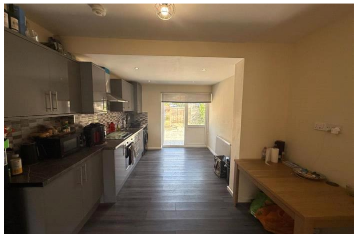
HAYDON ROAD, DAGENHAM £2,200 PCM