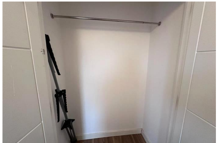
ROYAL ANGLIAN WAY, DAGENHAM £3,000 PCM