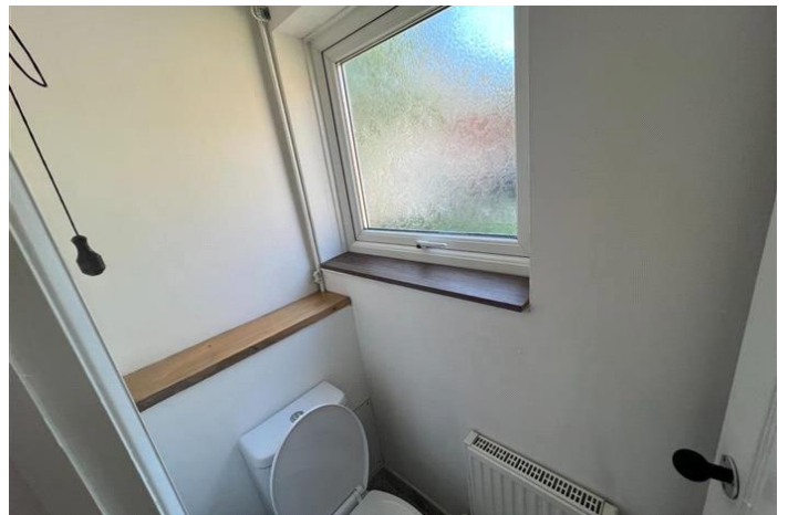
BREMPSONS, BASILDON £2,000 PCM